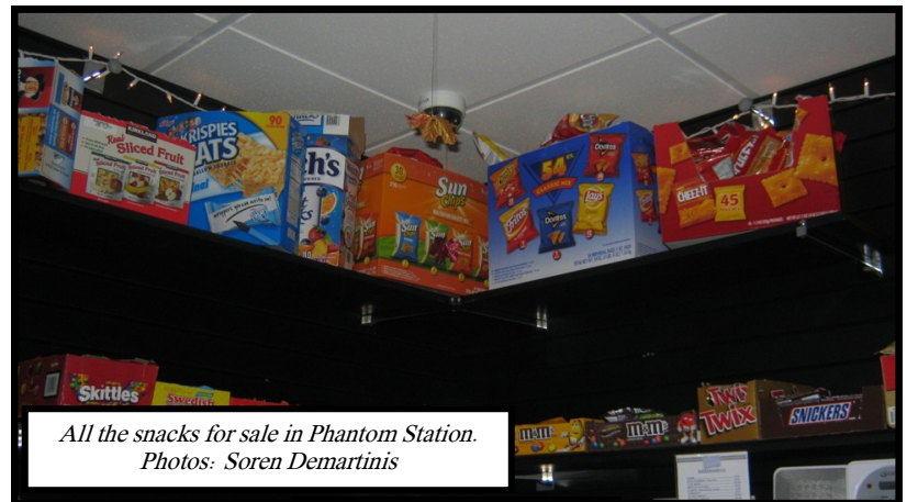
All the snacks for sale in Phantom Station.

The school's FBLA organization funds Phantom Station, and all money made from the store goes back to FBLA. So, support your school by buying a sweatshirt, some food, or a Thirty-One bag.