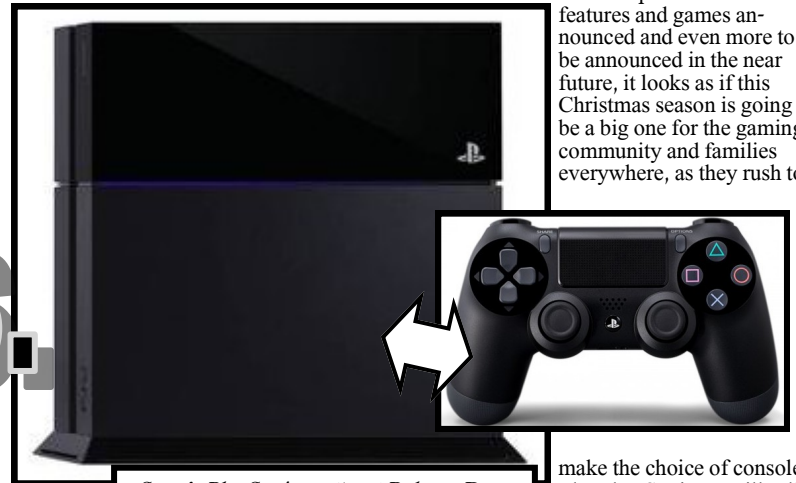
Sony's PlayStation 4 ($399) Release Date: November 15

With a plethora of new features and games announced and even more to be announced in the near future, it looks as if this Christmas season is going to be a big one for the gaming community and families everywhere, as they rush to